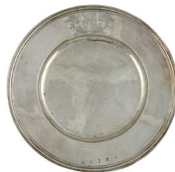
Lot 266 A Charles II armorial silver plate, London 1677 Sold for £4,800