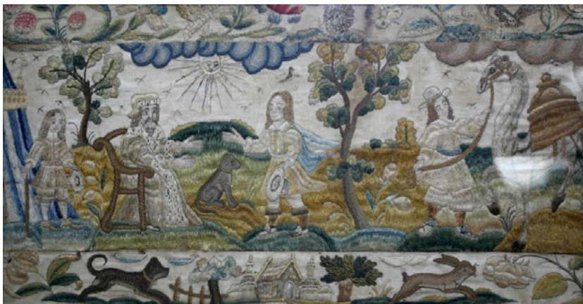
Lot 372 – A 17 th century needlework picture sold for £1,400

With Christmas almost upon us Chorley's varied sale on Thursday 15 th December 2011 saw a number of strong prices.