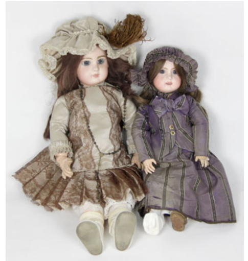
Lot 302: A Jumeau bisque head doll sold for £2,000

For press information or jpeg images please contact Iona Sale, IONA PR, on 01451 832 268, 07721 030 825 or iona@ionapr.com