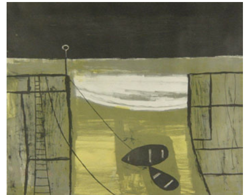
Lot 35: a lithograph of Mousehole by William Scott sold for £3,800

Telephone: 01452 344499 Fax: 01452 814533 Email: enquiries@simonchorley.com Web: www.simonchorley.com